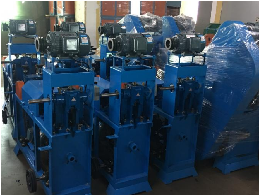
Display after straightening the iron wire